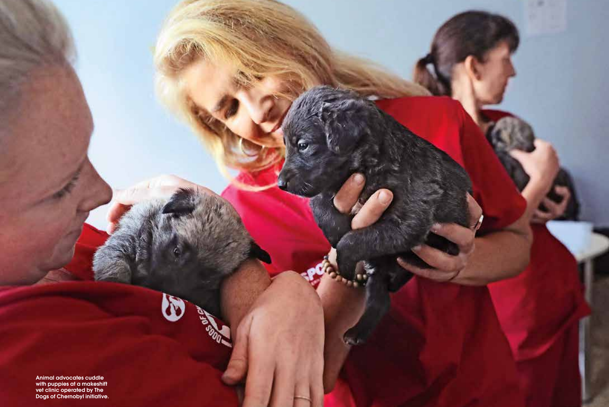
Animal advocates cuddle with puppies at a makeshift vet clinic operated by The Dogs of Chernobyl initiative.

part to the popularity of the HBO series on Chernobyl, Kiev's tourism and promotion department has reported it expects 100,000 visitors to Chernobyl this year.