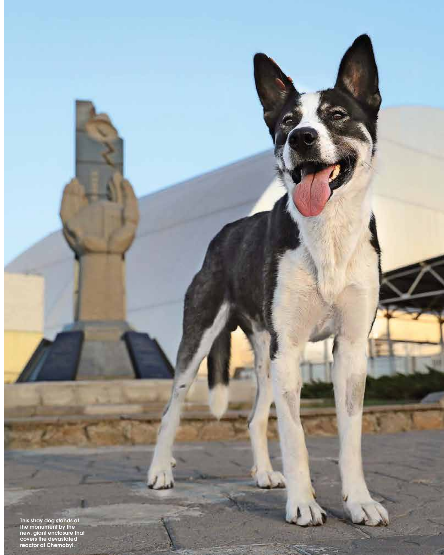
This stray dog stands at the monument by the new, giant enclosure that covers the devastated reactor at Chernobyl.

At the same time, thousands of soldiers were recruited to reduce some radiation in the Zone by removing and burying contaminated materials, like soil. They also worked to ensure Ukrainians obeyed the restrictions on entering the contaminated area.