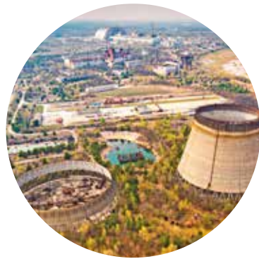
This aerial shot shows Chernobyl's nuclear reactors with canals in the spring.

Andriivka, Chernobyl, Kopachi, Poliske, Pripjat, Tarasy, Velyki Klishchi, Vilcha, Yaniv. These are modern ghost towns created by the same nuclear disaster. Once lively northern Ukrainian municipalities that housed farmers, artisans and employees of the Chernobyl nuclear power plant, they were deserted following a catastrophic accident that happened at the nuclear plant on April 26, 1986. The trouble started when a power surge occurred during a routine safety test, sparking two enormous explosions in the plant's No. 4 nuclear reactor. The explosions were strong enough to blow the reactor's 1,000-pound roof off, allowing massive amounts of radiation—the equivalent of 400 Hiroshima bombs—to leak into the air, water and soil, and into plants, animals and people, as well.