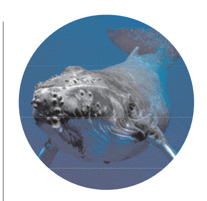
Pay it forward: A baby humpback whale learns feeding techniques from peers and then passes that information on to others.

From sperm whales to macaws, that's a big leap! What did you learn from observing macaws?